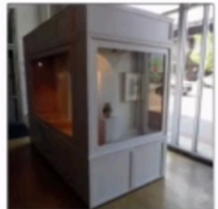
Street Level Display Case