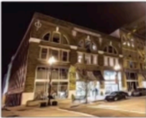
Emporium, Street View